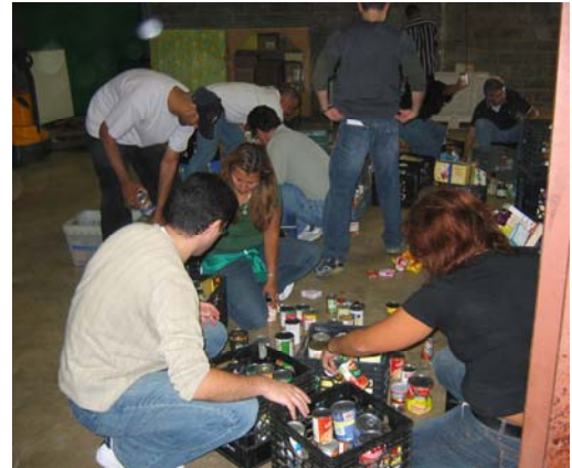
Volunteer team sorts food in the warehouse.

Charles Wesley UMC Church of the Good Shepherd UMC CommunityYoga Dominion Valley Garden Club EAI Technologies Fairfax County Chapter of Thrivent Financial Fannie Mae Foundation Ferguson Enterprises First Potomac Realty Investment, LP Friends of Vale Schoolhouse Girl Scout Troop 5553 Greenbriar OB GYN Gregory D. Bath, DDS, PC Hester & Company, P.C. Hilliard Charity & Fellowship Outing Idylwood Presbyterian Church J G W Group Lambert, Riddle, Schimmel & Caldwell Insurance Law Office of Kevin L. Fast Learning Technology Institute Little River United Church of Christ Lord of Life Lutheran Church Merrifield Lions Club Mount Olivet UMC Northern Virginia Ethical Society Oakton Womans Club Olivet Episcopal Paul VI High School PeopleCom Inc. Philip L. Graham Fund Pohick Episcopal Church Providence Presbyterian Church Ronnie Elias Salons, Inc. SAIC Signs by Tomorrow St. Anthony's Catholic Church St. Dunstan's Episcopal Church St. James Catholic Church St. Mary of Sorrows Church St. Matthew's UMC St. Thomas a Becket Catholic Church Strategic Mgt. Services - USA