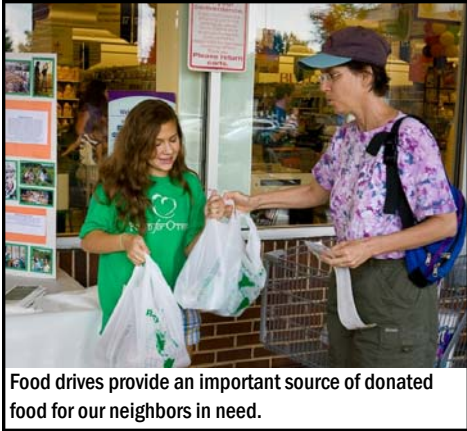
Food drives provide an important source of donated food for our neighbors in need.